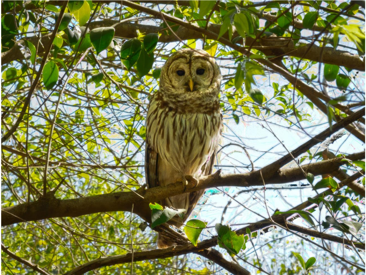
The Meeting Owl, joining us regularly since March 12.