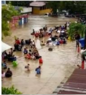
San Pedro Sula, Honduras

Hurricane Eta has hit Central America with devastating consequences. Partners in Honduras and Guatemala have been particularly affected. Bridges have fallen. Whole neighborhoods are under water. People line rooftops awaiting evacuation by boat. In many areas where houses have not flooded, there is no running. The situation, already dire due to Covid, hunger and violence, is now much worse.