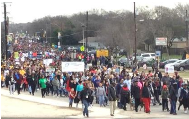
The February 2019 MLK March