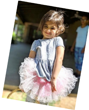
Easter at the Meetinghouse