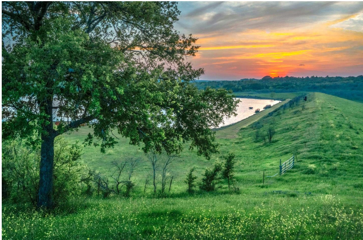
Sunset at Greene Family Camp, South Central Yearly Meeting, 2015