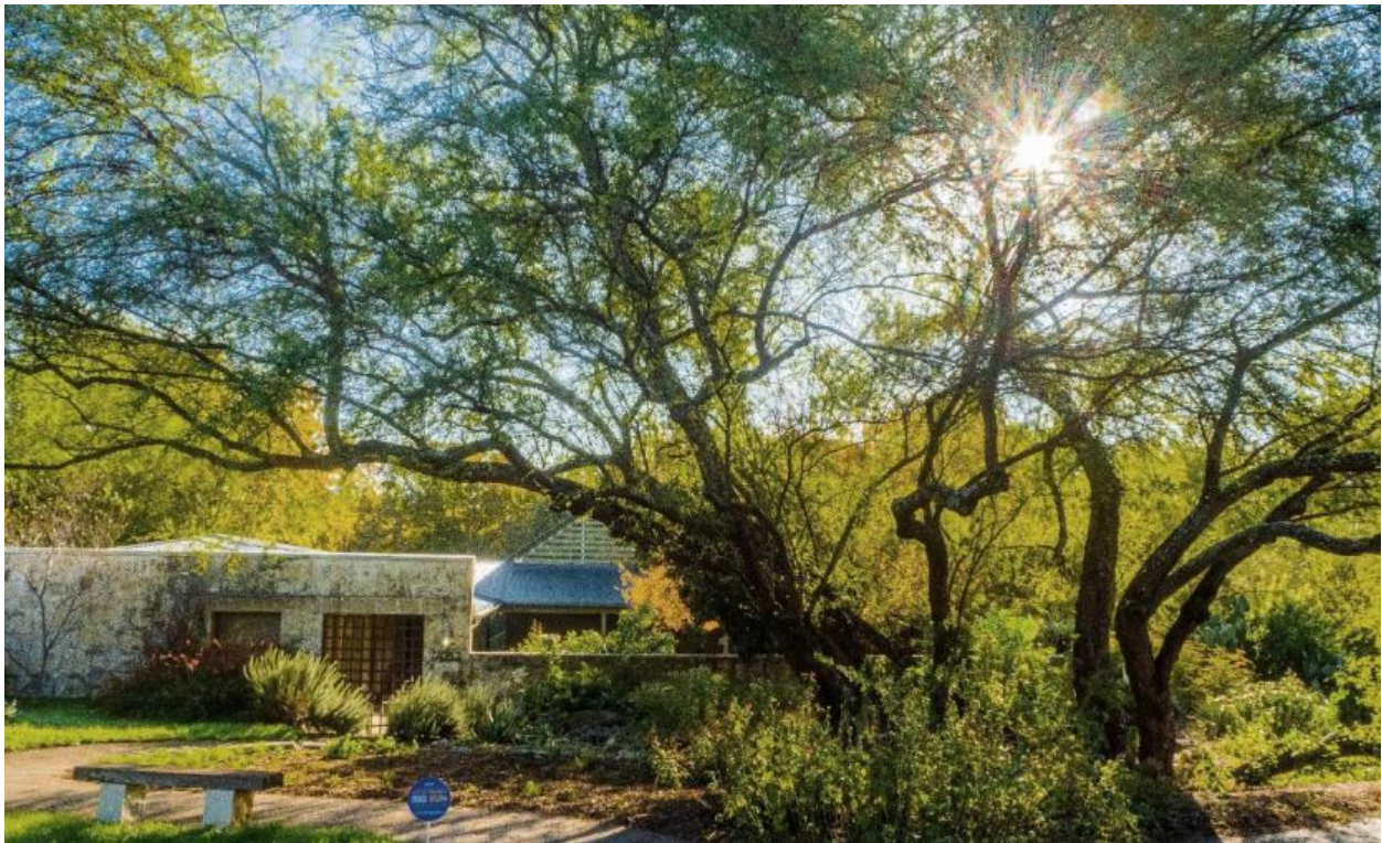
November Morning at the Meetinghouse